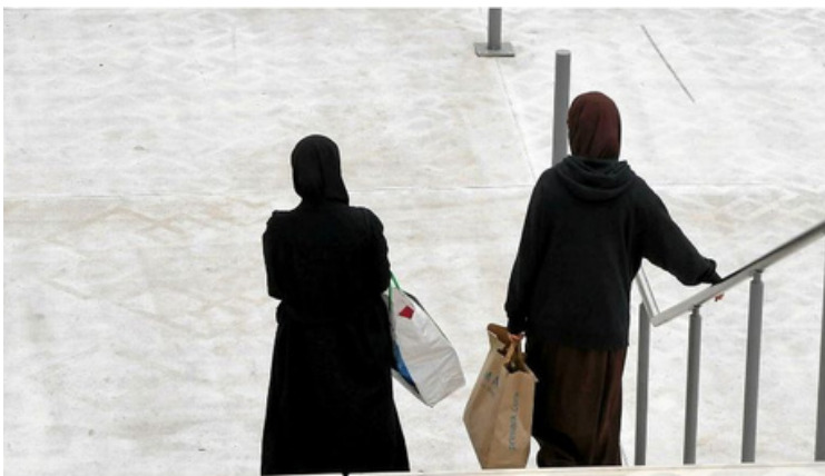
Women wearing abayas in Lyon.

The document proposes creating Islamic schools and education faculties exclusively for Muslim children, which would be funded through charitable bequests, donations from governments of Islamic and European countries, and European charitable associations.** A scientific body, supervised by Icesco, along with an Islamic observatory in Europe, would be responsible for developing a teaching methodology specific to private Islamic schools, with the possibility of coordination with European educational authorities.