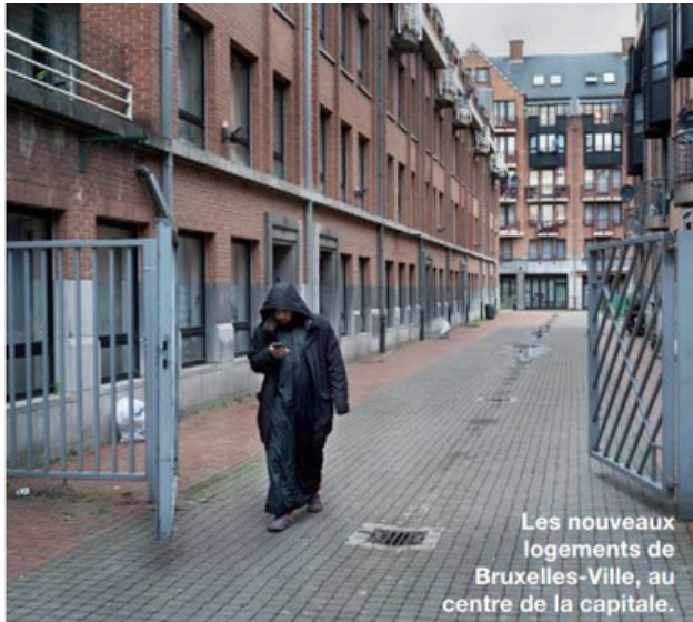
The new housing in Brussels-City, in the heart of the capital.