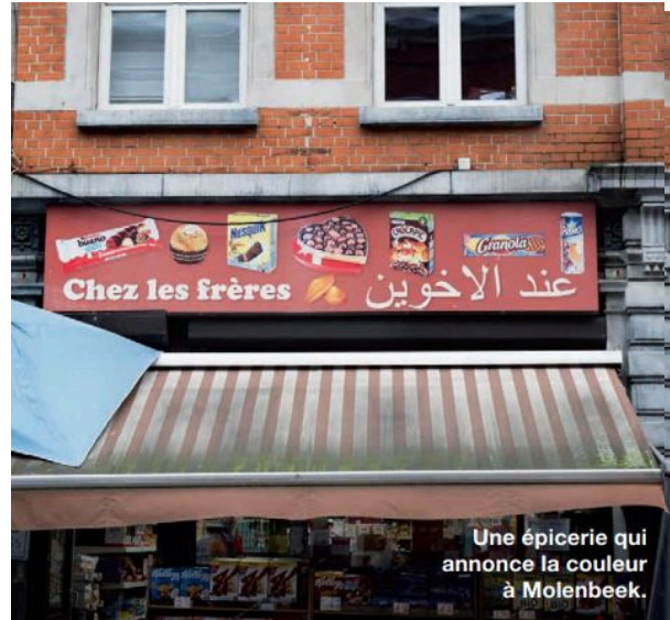
A grocery store that shows its true colors in Molenbeek.

Schools should take all possible measures to verify the factual accuracy of representations of Islam in the textbooks and library books they use, and to ensure that they include photos of Muslim students in a non-tokenistic way in textbooks for all subjects. [...] Local educational authorities and schools should ensure that where citizenship is taught as a subject, it is taught in a manner that is sensitive to the particular issues faced by Muslims as British citizens. This may require the development of specific materials related to Muslims and citizenship that schools can use both with Muslim students and in the context of fostering intercultural understanding and respect. [...]