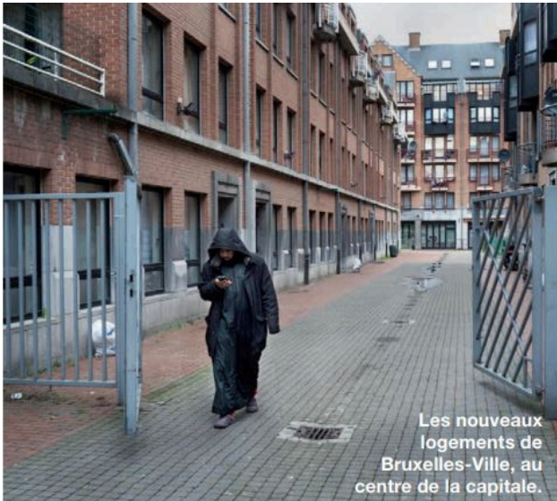
The new housing in Brussels-City, in the heart of the capital.