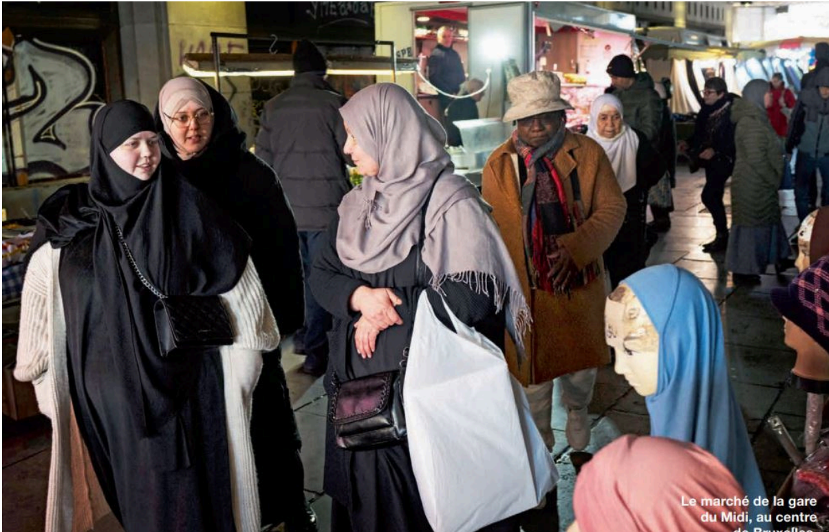
The market at Gare du Midi, in the center of Brussels.