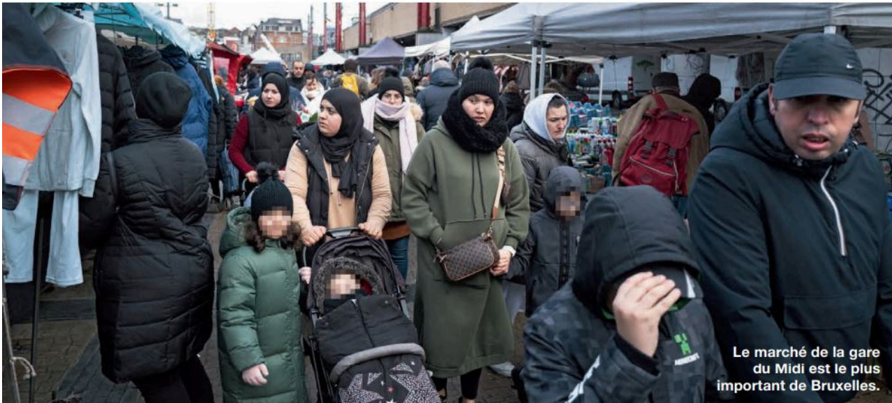
The Gare du Midi market is the largest in Brussels.

Finally, the strategy advocates for the development of Islamic education to promote "the teaching of Islamic values and ethics alongside scientific and cognitive training." Only Islamic education, it argues, can "design and develop educational visions and methods capable of sparing children from the characteristic problems of life in a Western environment and freeing them from the cultural divide they suffer from."