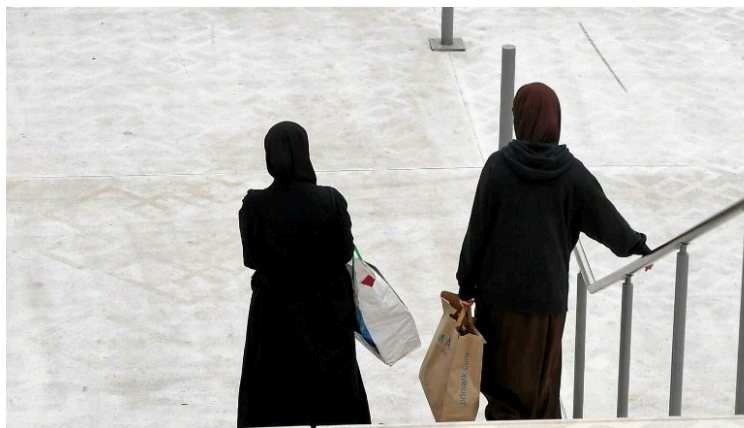
Women wearing abayas in Lyon.